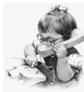
First Steps families should contact their service coordinator and ICC if problems are encountered.