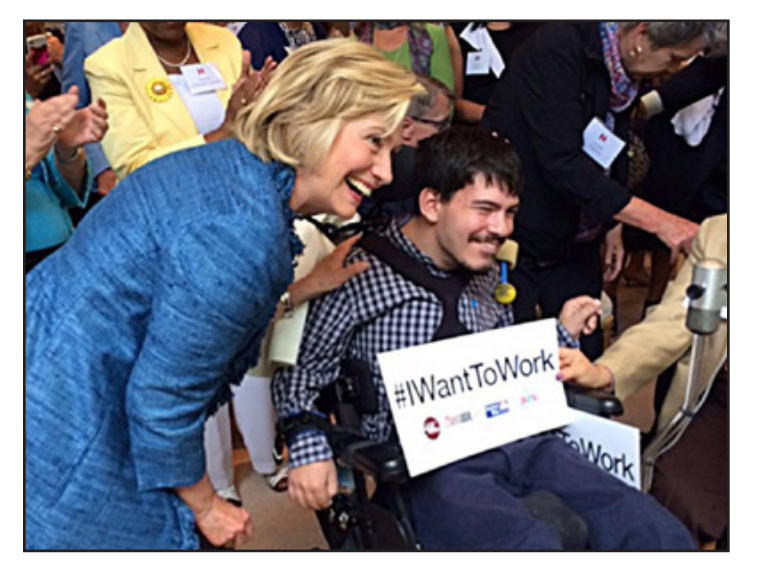
We should acknowledge how the disabilities community has played such an important role in changing things for the better in our country.

Last year, in speaking about the Americans with Disabilities Act, I noted that the ADA made our country more inclusive, our economy stronger, and our society fairer. This landmark law opened educational opportunities, expanded transportation, ensured equal access to public buildings and outlawed employment discrimination on the basis of disability. The ADA enables people with disabilities to participate more fully in their communities and live more inclusive lives.