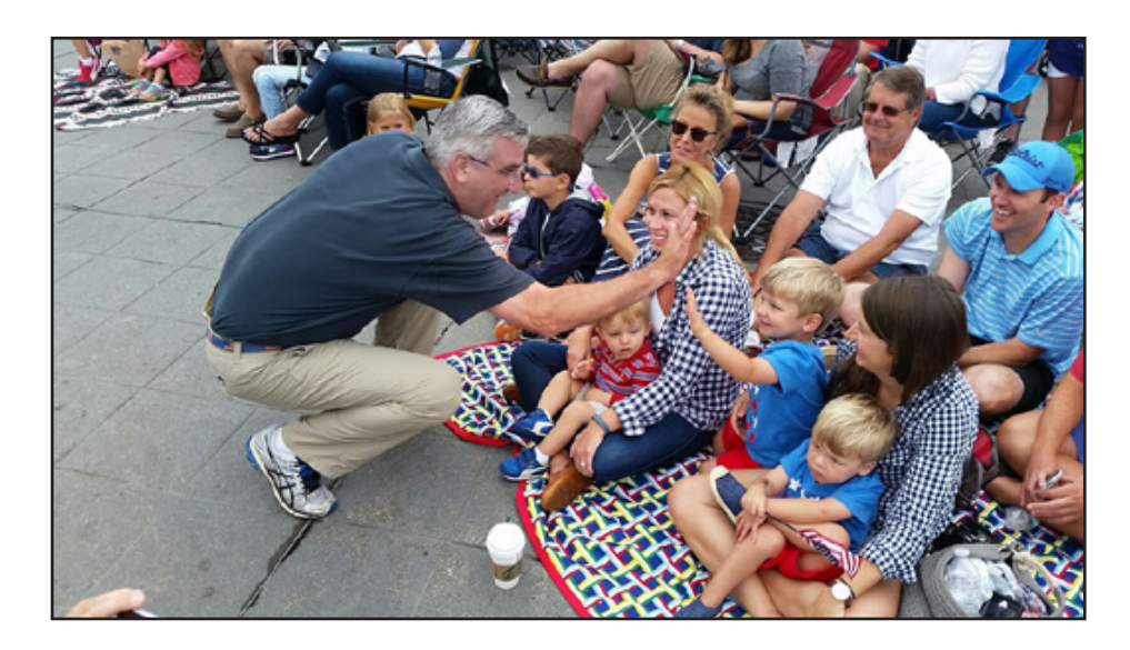
It is important that we continue to develop and deliver services that provide all Hoosiers real avenues to self-sufficiency and self-reliance.